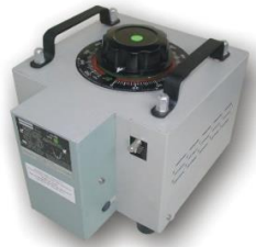
20A to 28A