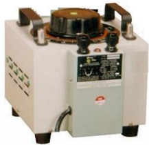
2A to 15A with output post terminals Aust Input AC lead and plug

Single Phase - (P) Portable / Bench Top - Air Cooled - Manual